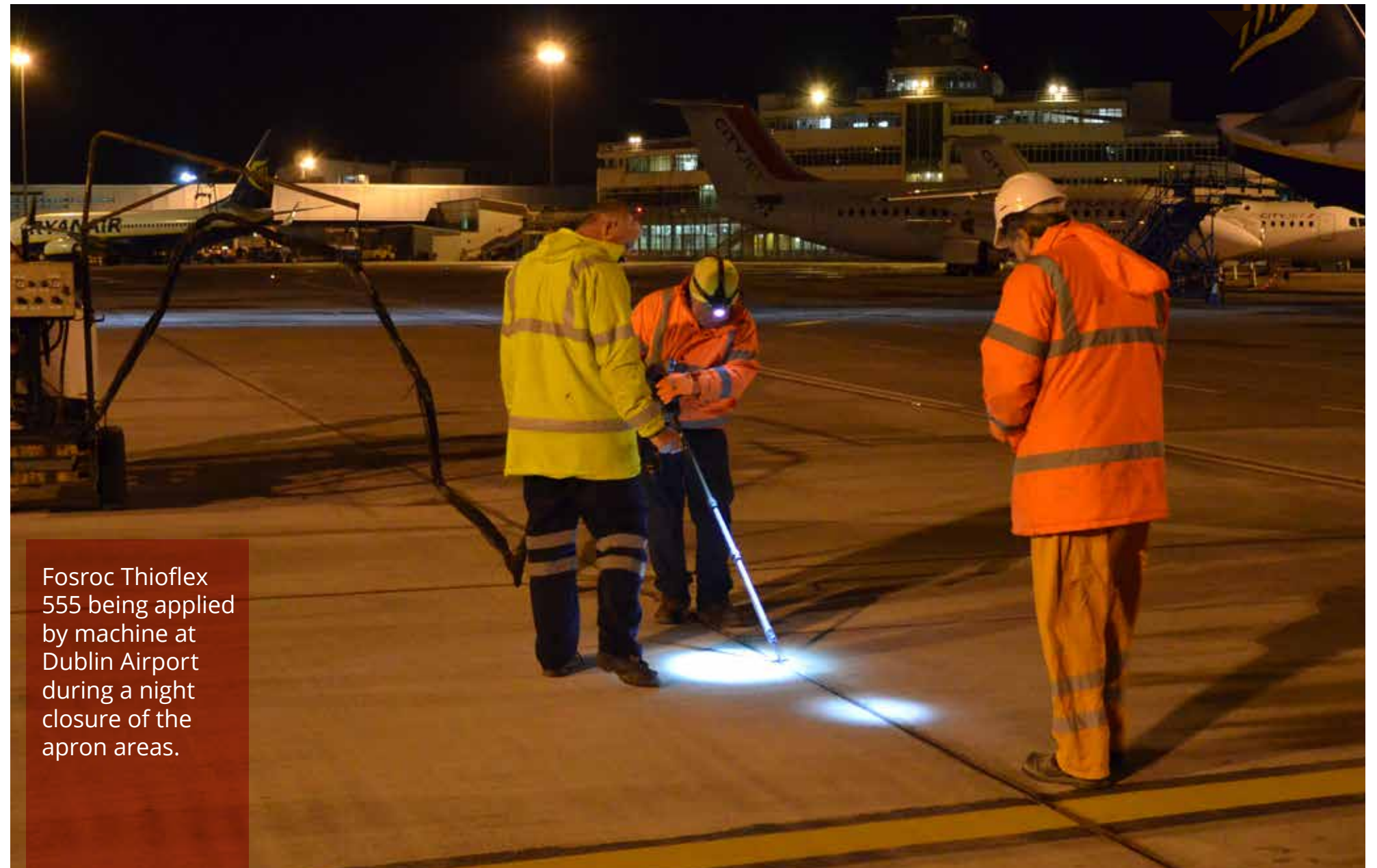
Fosroc Thioflex 555 being applied by machine at Dublin Airport during a night closure of the apron areas.

Fosroc joint sealants were selected due to their resistance to all fuel types including aviation fuel, oil and hydraulic fluids along with their high durability and high movement accommodation.